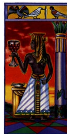
XXXVIII. MISTRESS OF CUPS QUEEN OF CUPS IBIS DECK