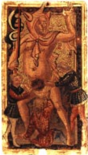
FOOL CARD ECOLE D'ESTE DECK