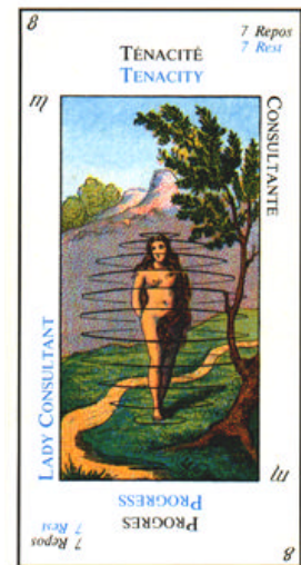
EVE GRIMAUD ETTEILLA DECK