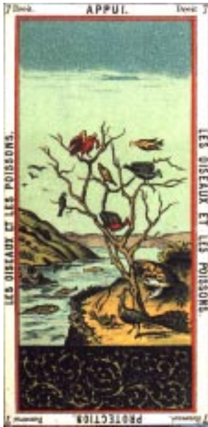
BIRDS AND FISHES FROM GRAND ORACLE DES DAMES DECK

The optimist Gnostics believed that Eve was supposed to bite the apple. This strain of Gnostics (and there were others who disagreed) felt that without the biting of the apple, literal time and space would not have precipitated out of eternity. Hence, in the