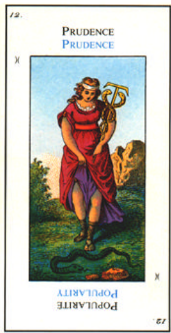
PRUDENCE GRIMAUD ETEILLA DECK

Hanged Man in the Eteilla deck has left behind the Judeo-Christian idea of human guilt for the “fall of man” and its expiation in