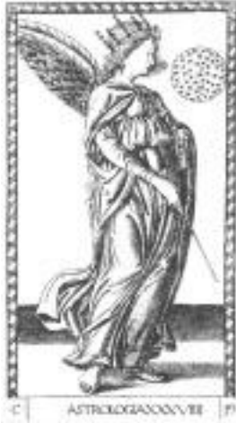
ASTROLOGIA MANTEGNA DECK

Reincarnation was part of the belief system of the ancient world. In a very general sense, the Gnostic gospels assert that when the Creator fashioned the material plane, it was set up in solar system form with seven planets. At that time people thought the planets all revolved around Earth and that Earth was protected and guarded by the rings of the other planets.