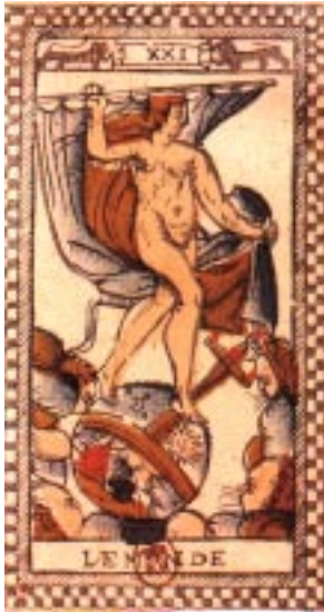
WORLD CARD ANONYMOUS PARISIAN DECK

If one were looking for clues to this ancient Hebrew form of the goddess on the Tarot, one could look for images that show qualities of the Matronit on the cards. Taking up the list of her qualities, we could easily see the four