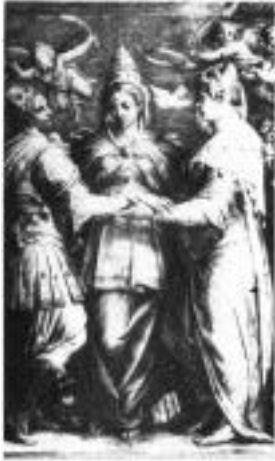
“PAPAL TRIUMPH” BY GIORGIO VASSARI MID 1500’S