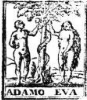
ADAM AND EVE LABYRINTH GAME

principle. Gnostics fostered the belief that Sophia, the Wisdom element of God, was feminine and represented the mind, meaning the actual conscious thinking that was vested in the making of Creation by the Creator. It is she who takes the creative juices of God and ferments them into the tangible world, the ecology of life. She creates what is actual out of the infinity of creative possibilities inherent in God, the undifferentiated Power.